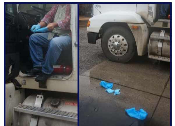
Leave trash generated on the operation behind.