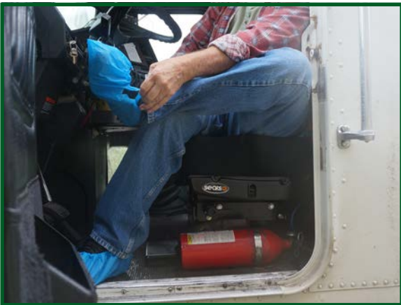
Wear clean footwear that can be cleaned if it becomes soiled with manure. If necessary, disposable boots may be provided by the operation for visitors.