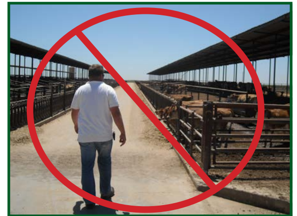
Avoid direct contact with cattle, cattle feed, manure, and other excretions. If cattle contact becomes necessary, follow required biosecurity protocols to avoid introducing or spreading disease.