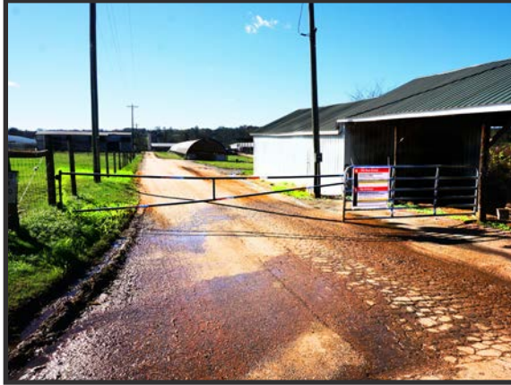
Respect the Line of Separation (LOS) between off-site and on-site traffic. Follow required biosecurity protocols when crossing the LOS.