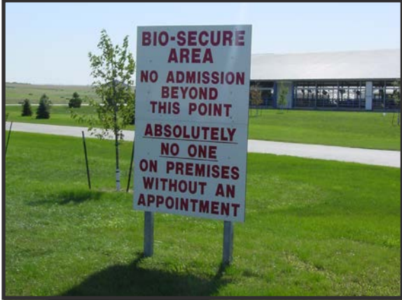
Make sure you have permission to enter this operation.