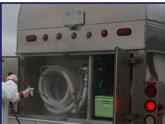
Ensure equipment is properly cleaned before storing or moving to avoid cross-contamination between operations.