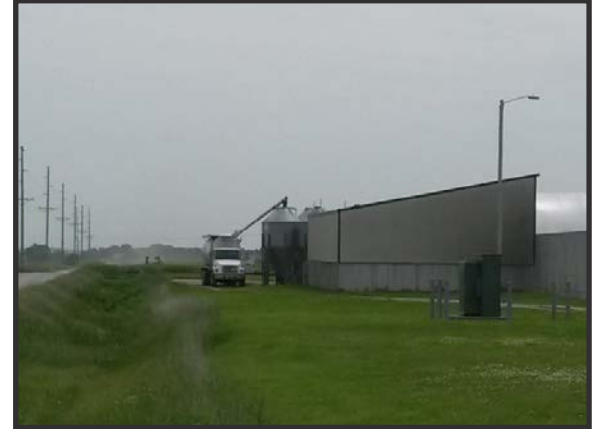
Drive and park in designated areas. Follow all posted signs.